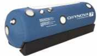
Oxynova HBOT 7