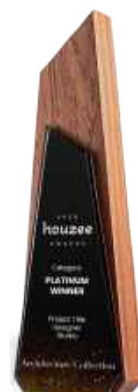
Houzee Award 2025