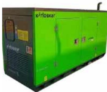
Kirloskar DG Sets