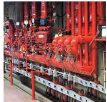
Fire Fighting Solutions