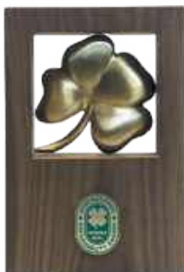
International Sustainability Award 2025