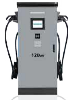
Siemens EV Chargers