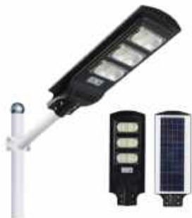
Solar Street Lights