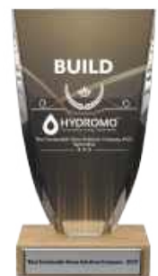
Build Award 2024