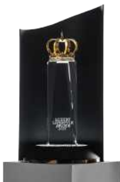
Luxury Lifestyle Award 2025