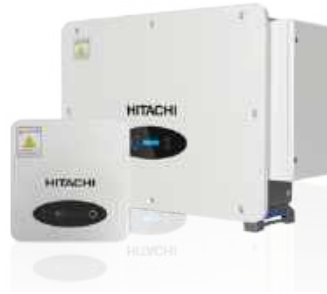
Hitachi Grid-Tied Inverters