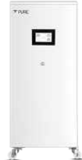
Energy Storage System