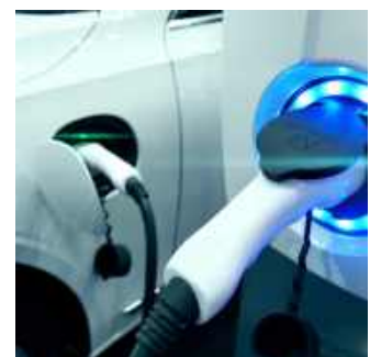
EV Charging Solutions